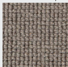
Plain: Miami Grey