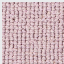
Plain: Pale Mauve