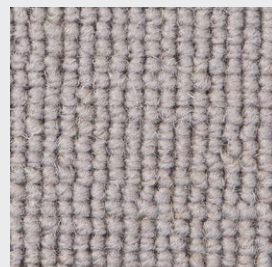
Plain: Dove Grey