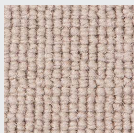
Plain: Italian Stone