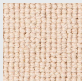
Plain: Snow White

Hugh Mackay Carpets Part of The Mackay Group T: 01429 892555 E: sales@hughmackay.co.uk W: www.hughmackay.co.uk